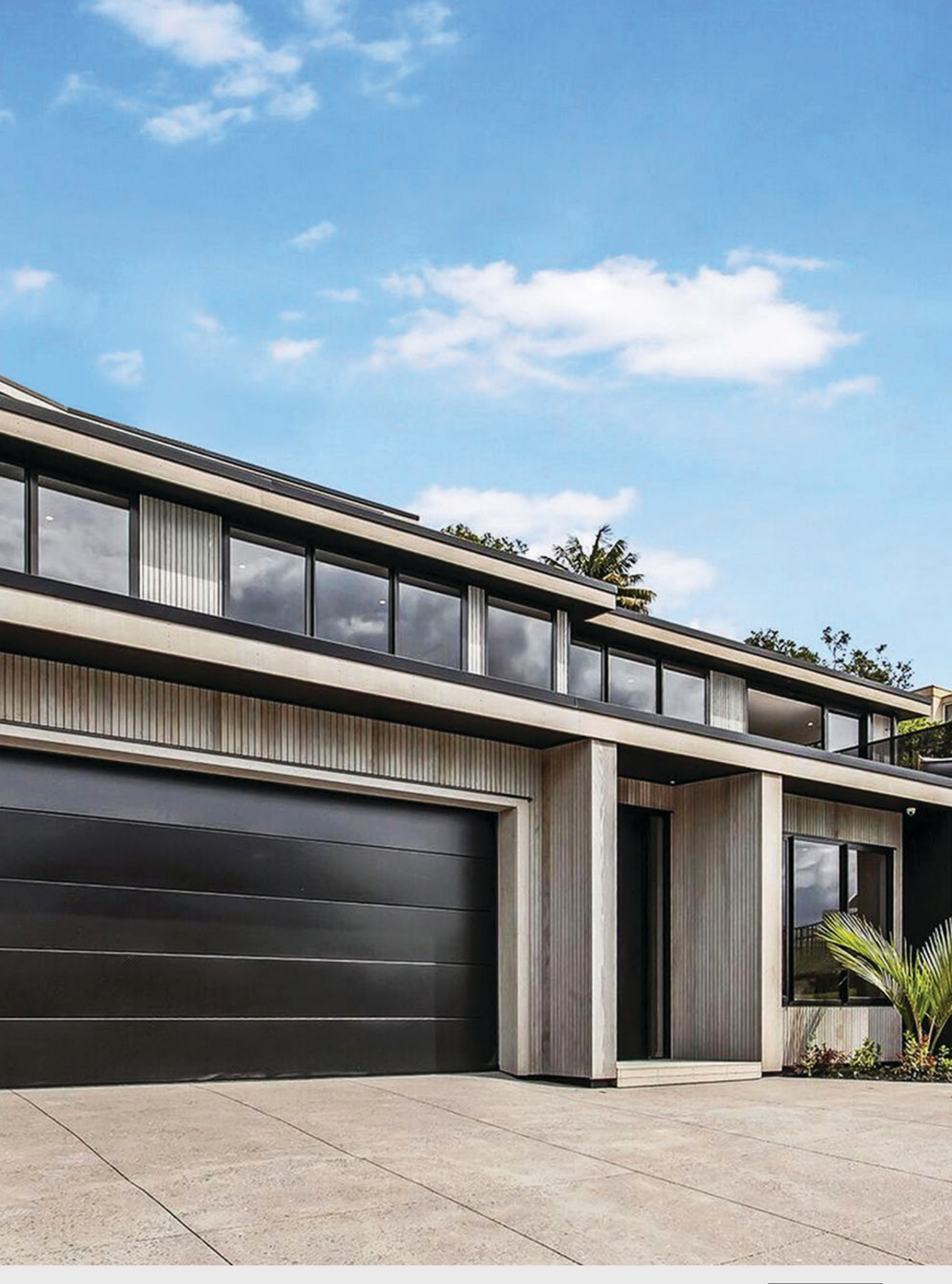
WOCA Denmark | New Zealand woca.co.nz