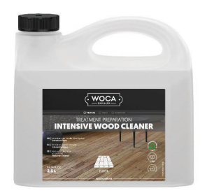
PREPARE WITH PREPARE WITH MAINTAIN WITH WOCA WOOD CLEANER WOCA NATURAL SOAP