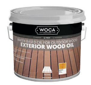
ALSO AVAILABLE WOCA EXTERIOR OIL